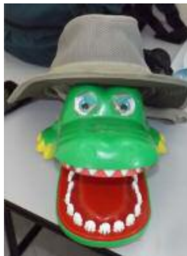
Our dental hygiene teaching aid taking a break during a particularly hectic day teaching children tooth brushing in Port-a-Piment, Haiti, July 2014.