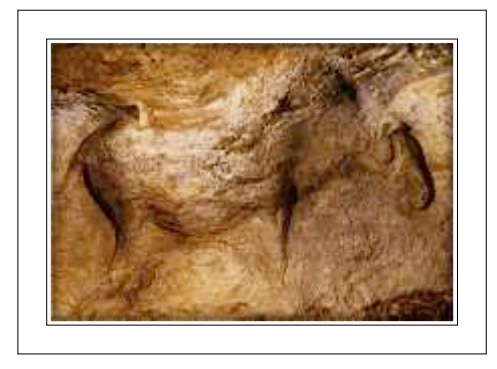
Horse from Frieze of Cap Blanc

There is a great deal of lore surrounding Magdalenian Girl: